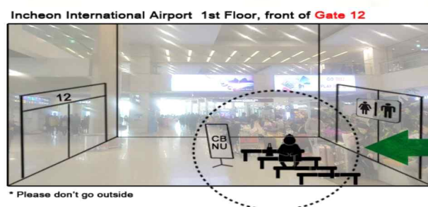
<Welcome Flag> at EXIT 12