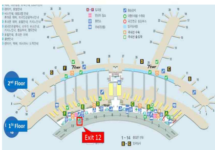
<Map of Airport>

* The Schedule may change depending on the number of applicants.